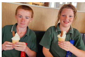
Reward for participation

We also had cooking as part of our Fun Friday, after